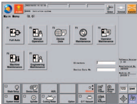
LCD touch screen

The bridge-type frame structure reduces footprint while increasing performance. Suspended from the bridge is a front-mounted spindle, which provides greater space to process large area substrates.