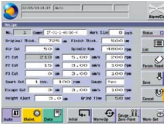
LCD touch screen